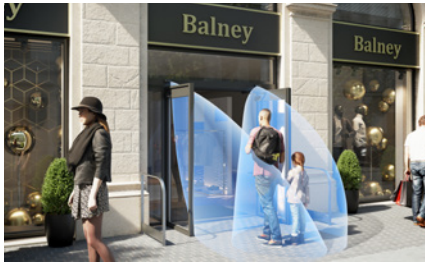
Double swing door